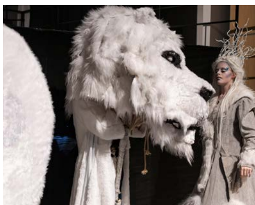
Lion, Witch & The Wardrobe