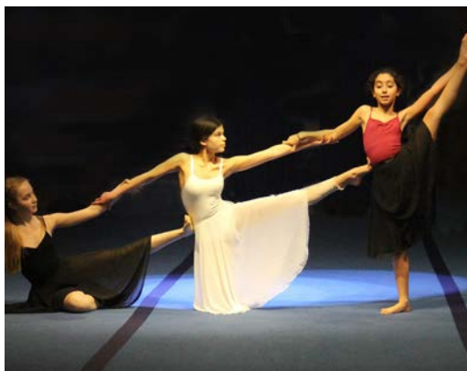
Gym & Dance